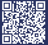
RUT950 360° VIEW